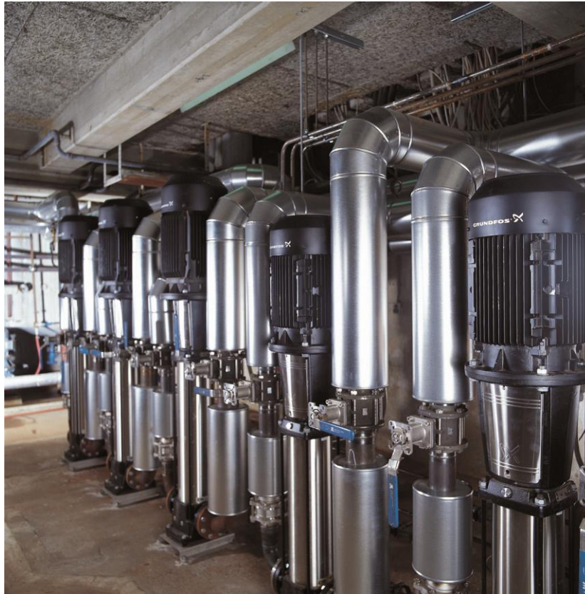
Image: For boilers without a valve or bypass, a streamlined system reduces installation and maintenance costs, according to Søren Mortensen, Grundfos Application Manager.

“Installation costs vary across the world, but the higher the pressure, the more expensive the feed valve required. So when higher pressure is required, the savings will be even greater with direct feed.”